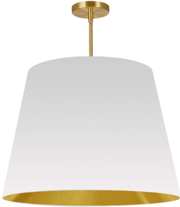
1 Light Oversized Drum Pendant Large White/Gold Shade